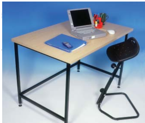
Desks can be made with Speedframe, just add castors or adjustable feet.