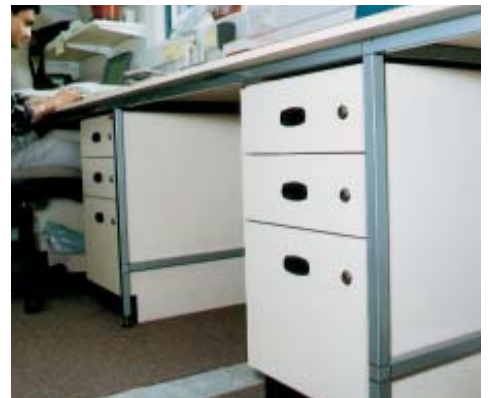
Robust, purpose made desks - made to fit within the office space.