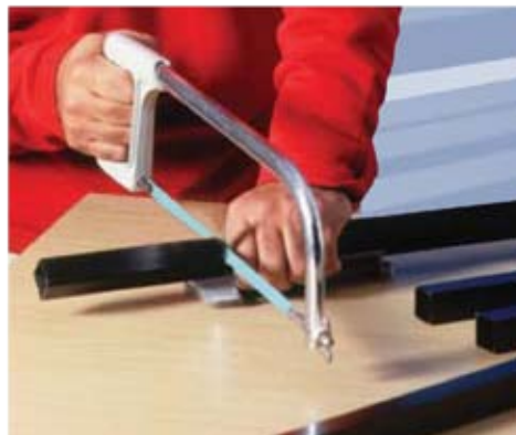
Start with the longest lengths first to ensure best economy. Tubes can be cut with a hacksaw.

Ensure inserts are fully into the tube before pushing in the arm of the joint. Make up the frames first, then join with the uprights. If cladding is being used, add as the sections are built up. Glass is fitted when the unit is complete.