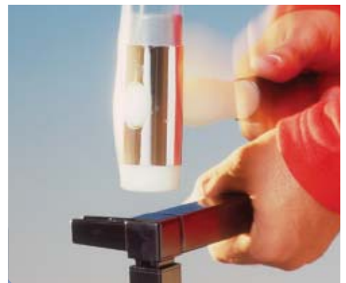
It's simple to construct and by using a white faced hammer, the joints are easy to assemble.