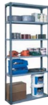
Create simple, robust shelving units with Slotted Angle.

The perfect everyday answer for simple rigid structures