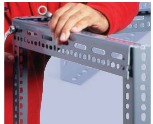
The slot pattern means that all four angles can be used together in an installation and the slots are designed to give the maximum number of nut and bolt positions.