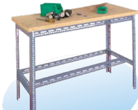
Strong, square structures are easy to build using Dexion Slotted Angle.