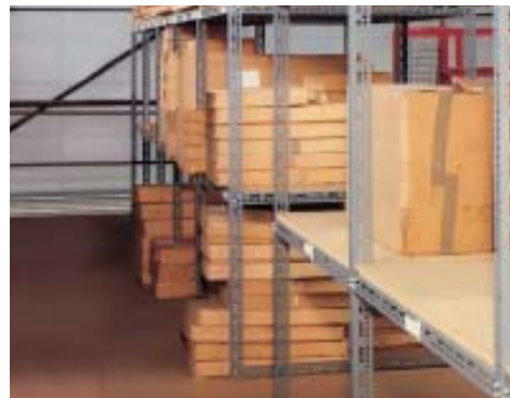
To ensure the structure is rigid, use Corner Plates on 140 or 160 Angle and two bolt fixings on 225 or 260 Angle.