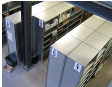
Hi280 is future compatible - you will always be able to expand the system.