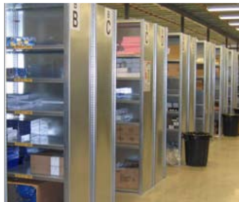
Easy to pick everything is immediately to hand.