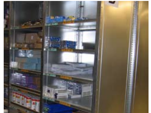
Exactly the way you want it - different standard uprights and beams cater for a wide range of loads.